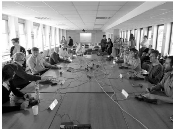
Fig. 2. The conversational simulation table

Over time, a third objective was gradually formalized. We moved one step further by designing conversational devices that involved and engaged participants more strongly. We sought for more active participation of group members in order to give rise to exchange emerging from the collective work. During the second seminar, the “conversational simulation table” was introduced and used in an afternoon session. The device enables group discussion based on the principle: one can choose whom to listen to, one cannot choose whom to address.