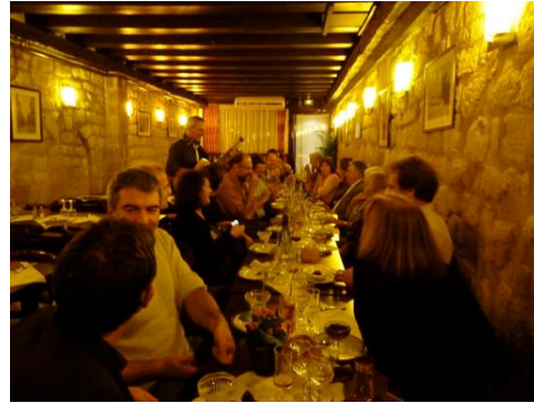
Fig. 5. Seminar 4 in Paris... gradually building a community

These three limitations to easy and constructive conversation were gradually avoided. Progressively transformed by the words and gazes of others, stimulated by more and more involving conversational devices, we observed in the next seminars a growing ability of the team members to interact around the artworks on a unified basis. This evolution translated into the progressive development of a common language, both on restructuring and art, into the setting up of a shared way of approaching artworks (openness to its ambiguous, plural and sometimes paradoxical meanings, detachment of the sole question of their “realism”, growing attention to esthetic questions), into more and more intertextuality (references to other artworks previously presented) within debates, etc. Finally, if interpretations were varied and sometimes even conflicting, the multiple interpretative communities facing difficulties to talk to each other gave birth to a (more or less) unified single interpretative community of inquirers able to grasp a same object with a same approach and create meanings out of their differences.