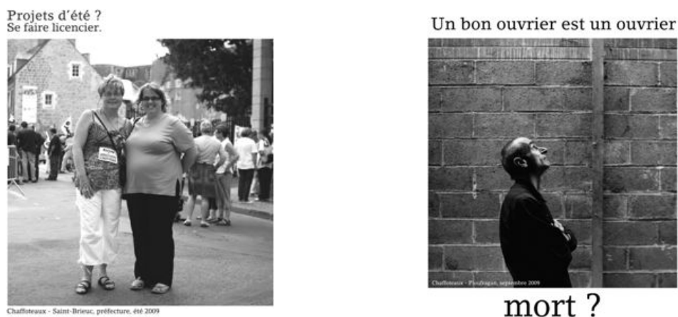
Fig. 6. Pictures of Chaffoteaux conflict, by François Daniel

• « Support to Chaffoteaux », or the everyday life of a conflict — On June the 18th, 2009, the French management of Chaffoteaux heralds the closing down of the plant in Saint-Brieuc. 204 employees are threatened. The conflict lasted more than 6 months, and ends with the signing of an agreement including an extra-conventional severance pay worth 25000 Euros for each worker, specific pre-retirement measures and a job center. Shortly after the beginning of the conflict, a representative from the local cultural authority, gets in touch with union representatives and suggests to hire a photographer to document the conflict and its daily round of activities. François Daniel, the photographer, sets in the plant and takes some pictures. As he puts it, « the first idea was to describe what was happening in order to witness; to portray these lived experiences ». At night, he prints his photographs and displays them in the hall of the trade unions the next day. He also posts the pictures to a blog in a chronological way. And he decides to print some postcards, entitled « Any summer project? Getting laid off » and « Any project after holidays? Getting laid-off », that have been sent across Europe.