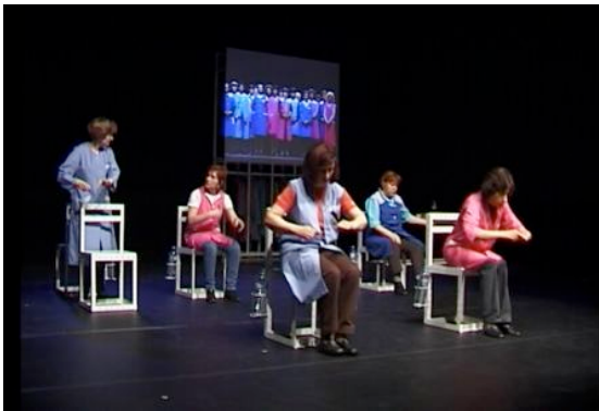
Fig. 8. Body and gestures rhythms at work in the play “501 Blues”

Hence the physical violence of the layoff and of the plant closure which is a radical change in life rhythms.