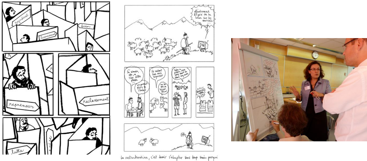
Fig. 3. Two comics realized by the participants (the first redesigned by young illustrators) and a picture the comic strip workshop (seminar 4)

The fourth seminar was an opportunity to propose a workshop about "comic strip" in which participants were invited to speak metaphorically as individual and as a group around their representation of restructuring by completing and illustrating the words: "Restructuring is like...".