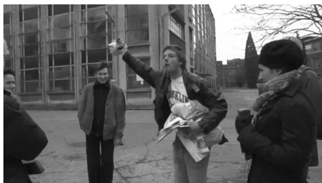
Fig. 4. Seminar 5 in Liège: an actor, playing the role of a homeless, is hailing the group

Another example is the fifth seminar in Liège, which was designed specifically around this type of engaging conversational devices putting participants in the role of "actors in a situation". These opportunities for collective production (experiencing a virtual restructuring, a photo album....) or experimenting situations such as the hailing of the group by a homeless man who turned out to be an actor during the visit of Liège, engaged participants through provocation, and helped to stimulate the discussion and the exchanges focusing on a shared experience.